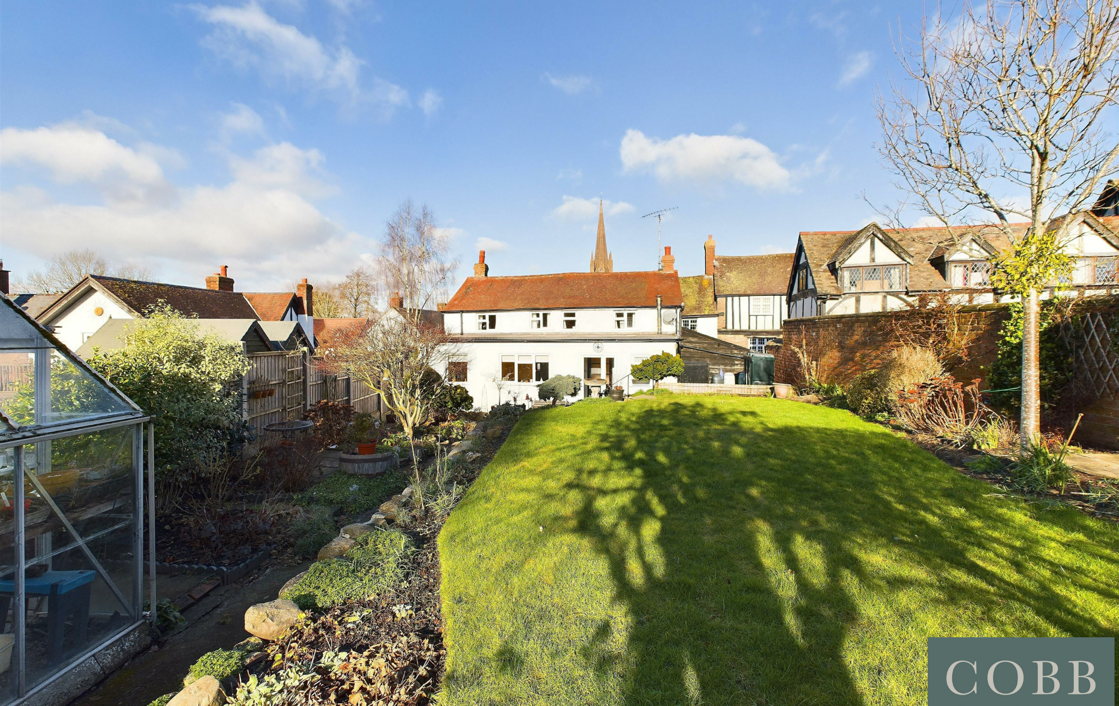
Brook Cottage, Bell Square, Weobley, HR4 8SE Price £360,000